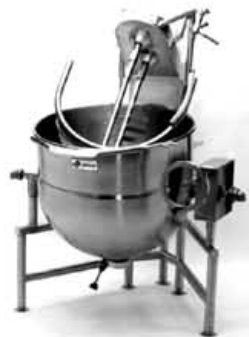
Model TWT-80 with mixer and optional bottom mounted butterfly valve