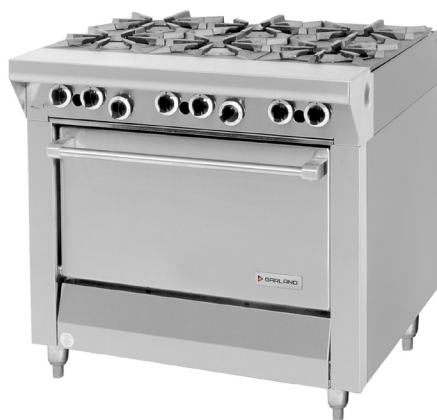
Model MST43R (valve control panel not as depicted) Range With Six Open Star Burners