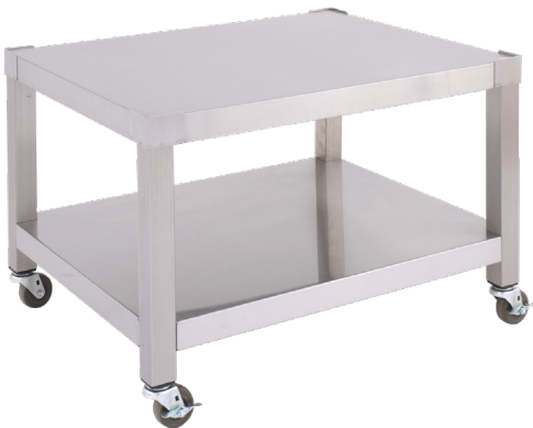
A4528796 Stand for 24" counter models with casters