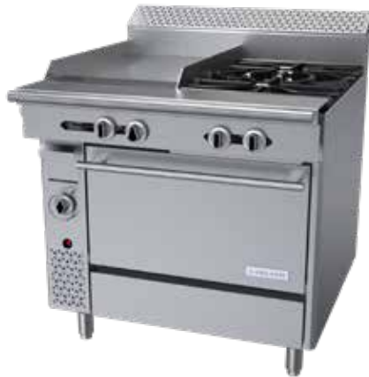
Model C36-4R Range with 18" Griddle, Valve Controlled, and 18" Open Burner