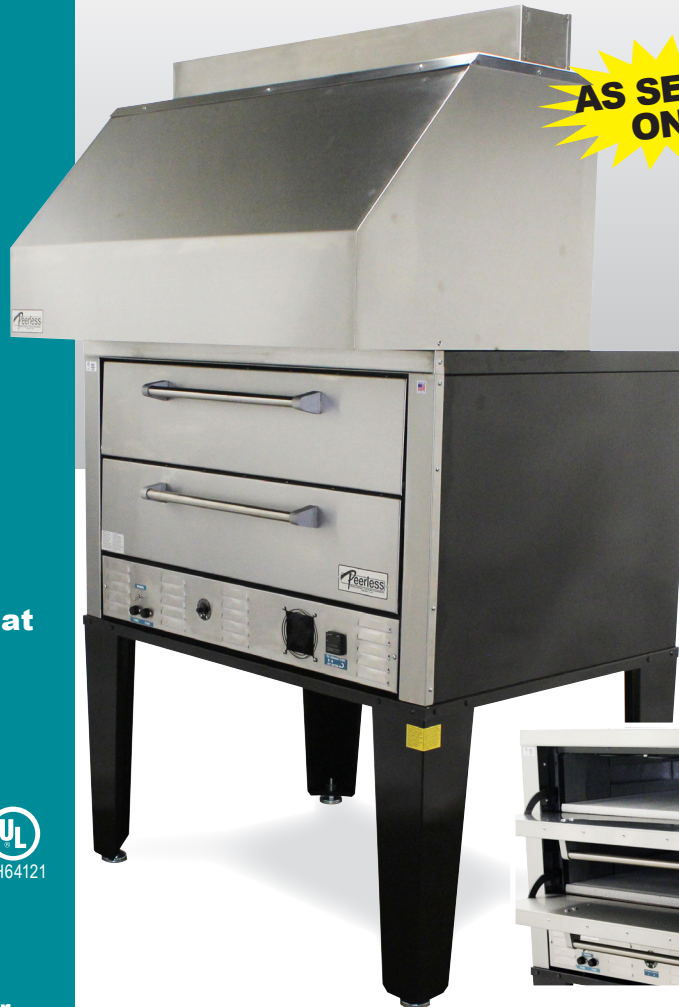
Shown CE61PE with Ventless Hood