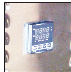
Digital Electronic Controller