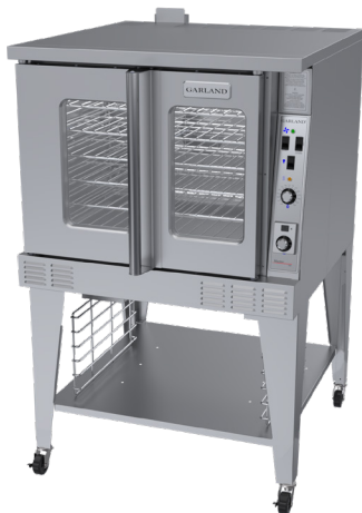
1951214 Rack Assembly with Casters Shown with MCO-GS-10-S Convection Oven