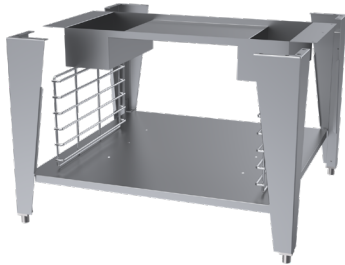
1951213 Rack Assembly