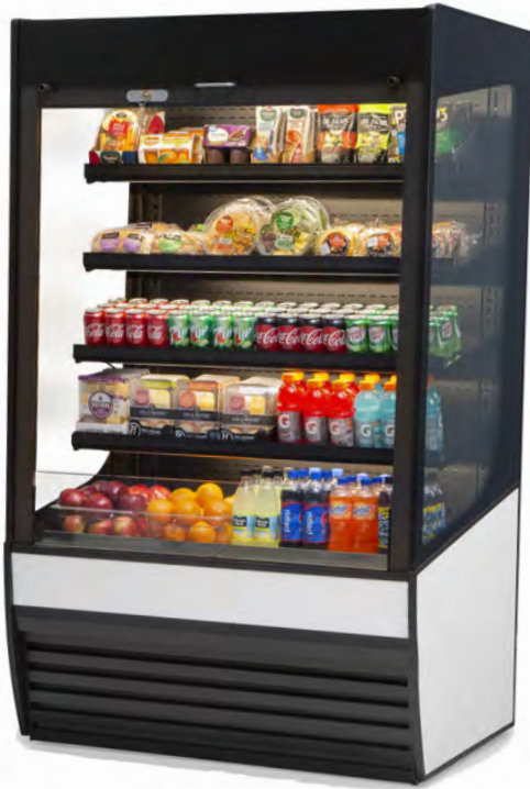
Model VRSS4878S Shown with Options

Designed with impulse sales in mind. Get maximum return from an attention-grabbing merchandiser and increase profits.