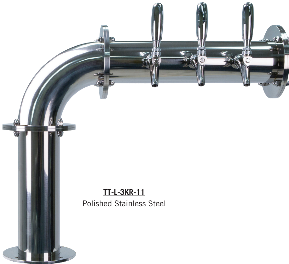
TT-L-3KR-11 Polished Stainless Steel