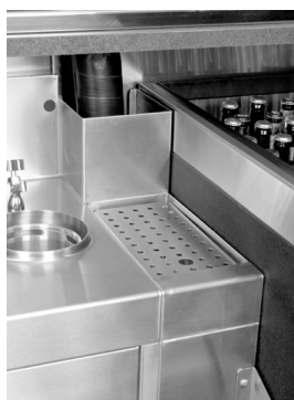
TCA shown in an installation setting