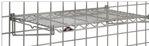
Grid Shelf FGS1224K3 (Green) FGS1224K4 (Gray) FGS1224S (Stainless)