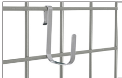
Large Hook HK25C (Chrome)