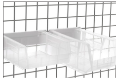
Bin Holder Single 3" (76mm) DD3722A Small 11" (280mm) PBA-1BH Large 22" (559mm) PBA-2BH