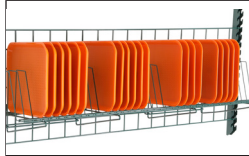
Tray Drying Rack TDR48K3 (Green) TDR48K4 (Gray) TDR48S (Stainless)

Fits 1/2 size pans, pan lids, small trays.