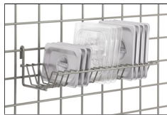
Lid Holder / Drying Shelf IWA-11K3 (Green) IWA-11K4 (Gray) IWA-11S (Stainless)