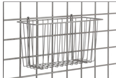
Small Basket H209K3 (Green) H209K4 (Gray) H209S (Stainless)