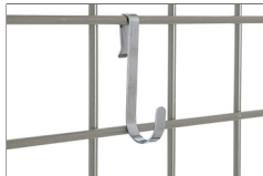
Small Hook HK23C (Chrome) HK23S (Stainless)