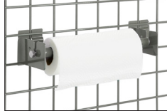
Sticker Roll/ Paper Towel Holder SRD15K3 (Green) SRD15K4 (Gray)