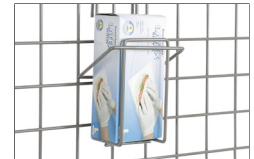
Glove Box Holder (Vertical) GBHVK3 (Green) GBHVK4 (Gray)