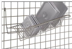
Slanted Lid Holder/ Drying Shelf IWA-S11K3 (Green) IWA-S11K4 (Gray) IWA-S11S (Stainless)