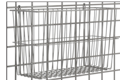
Large 10" Deep Basket H212K3 (Green) H212K4 (Gray) H212S (Stainless)