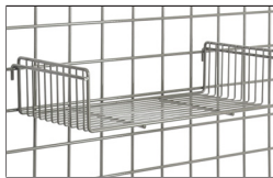
Light-Duty Shelf PBA-GSDK3 (Green) PBA-GSDK4 (Gray) PBA-GSDS (Stainless)