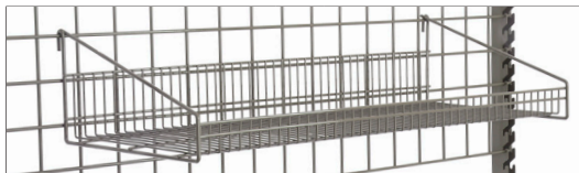
Shelf with Retaining Ledge: 14" (356mm) x 36" (895mm) Shown GS1436K3 (Green) GS1436K4 (Gray) GS1436S (Stainless)