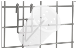
Cylinder Holder FCH (Green) FCHK4 (Gray) White Utensil Cylinder FC1