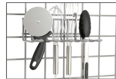
Large Utensil Holder IWA-12K3 (Green) IWA-12K4 (Gray) IWA-12S (Stainless)