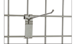
Prong Hook PGHK6K3 (Green) PGHK6K4 (Gray) PGHK6S (Stainless)