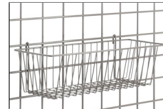
Large 5" Deep Basket H210K3 (Green) H210K4 (Gray) H210S (Stainless)