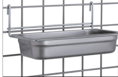
Pan Holder STP3BR (Brite) STP3K4 (Gray) (Pan Not included)

Fits 1/2 size pans, pan lids, small trays.