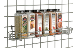
Utility Shelf SR24K3 (Green) SR24K4 (Gray) SR24S (Stainless)