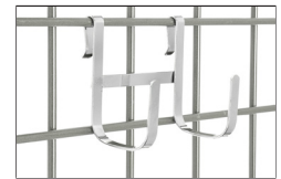
Double Large Hooks HK26C (Chrome)