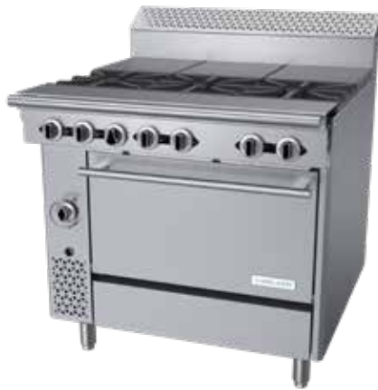
Model C36-15R Three 35,000 BTU/h 12" Open Burners with Three 15,000 BTU/h 12" Hot Tops