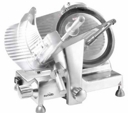
HBS-350L - 14" Slicer