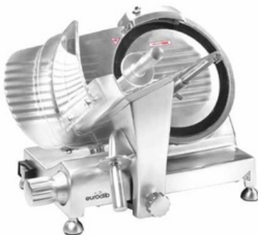
HBS-250L - 10" Slicer