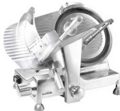
HBS-300L - 12" Slicer