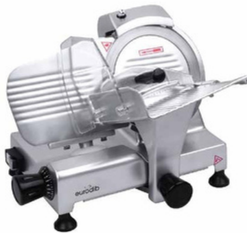
HBS-195JS - 8" Slicer