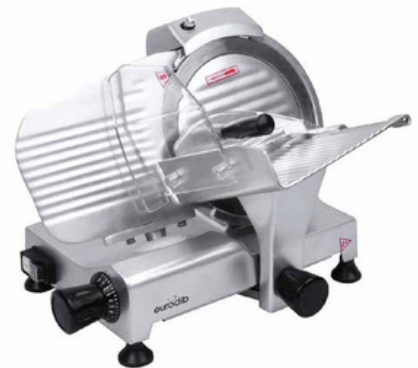
HBS-220JS - 9" Slicer