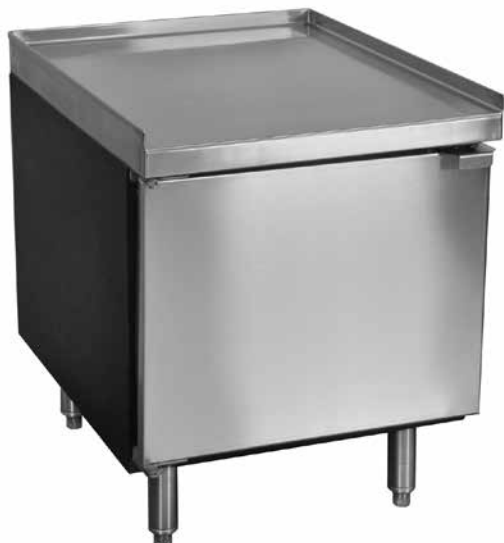
MS20 with optional legs