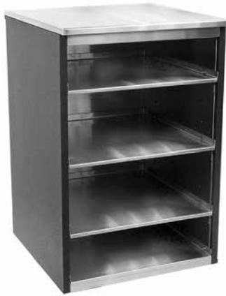
BGS-24 with optional stainless steel top