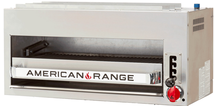
Model Shown ARSM-36