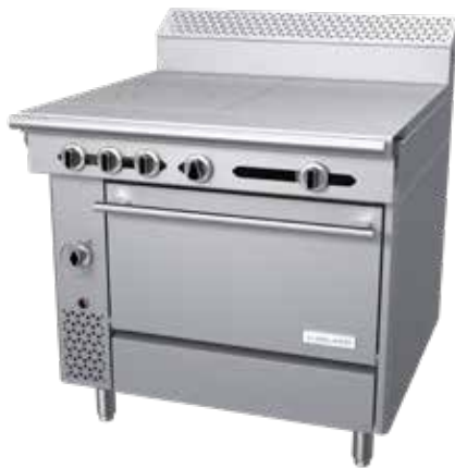
Model C36-11R 18" Front-Fired Hot Top and 18" Even-Heat Hot Top