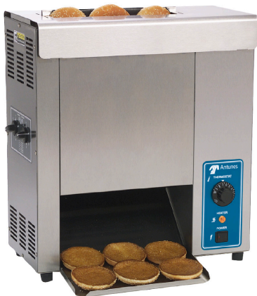
VCT-50 Vertical Contact Toaster

The Vertical Contact Toaster gives buns a consistent, golden brown finish which helps the sandwich stay firm and delicious. The VCT-50 has a preset toast time of 50 seconds.