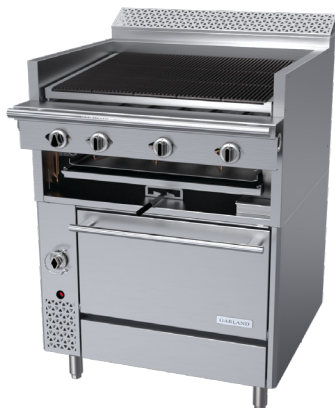
Model C36-ABR Range with 36" Broiler with Adjustable Racks