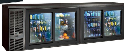
SDBS108 all black shown