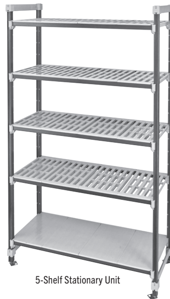
5-Shelf Stationary Unit