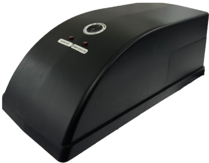
Crathco Autofill Lid Puts a Lid on Labor