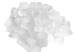
NUGGET ICE 85% ICE HARDNESS FACTOR