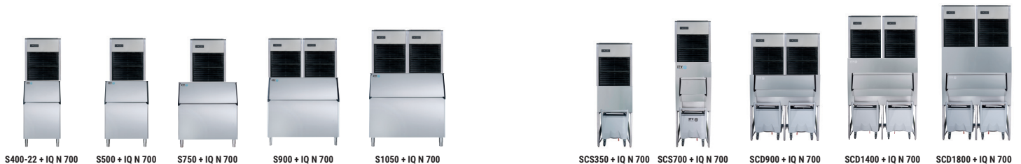
S400-22 + IQ N 700