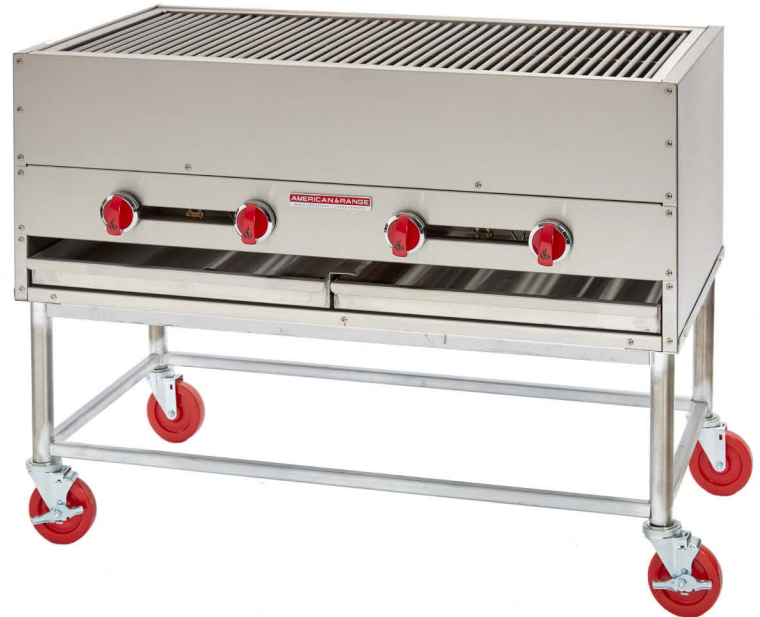
Model Shown AHS-4836 Shown with optional casters