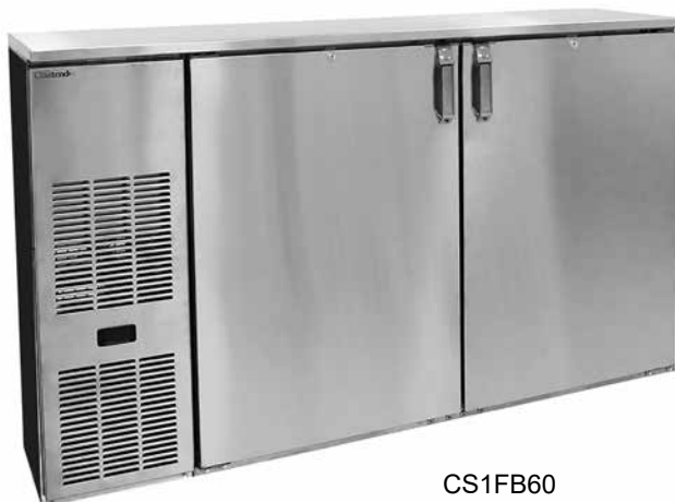
CS1FB60 Stainless steel doors, and top