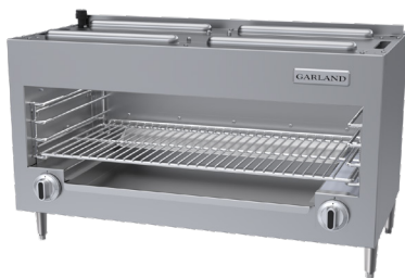
Model CIRCM36C with legs