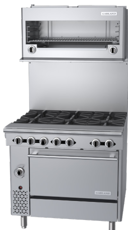
Model CIRCM36 Range Mount on a C36-6R