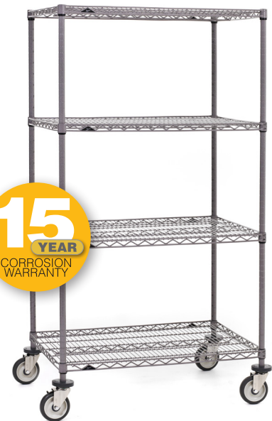
Super Erecta with Metroseal NSF listed for wet environments