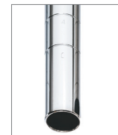
Post for Stem Caster