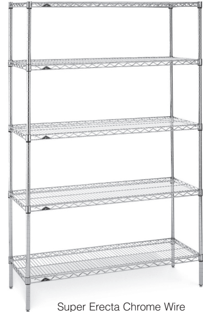
Super Erecta Chrome Wire

Note: Stainless stationary posts are equipped with stainless steel leveling feet.