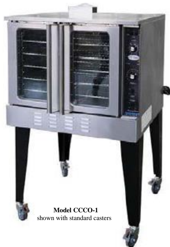
Model CCCO-1 shown with standard casters