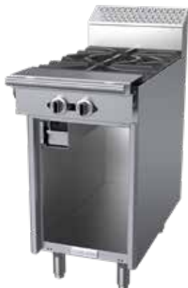
Model C18-7S 18" Add-A-Unit Open Burners