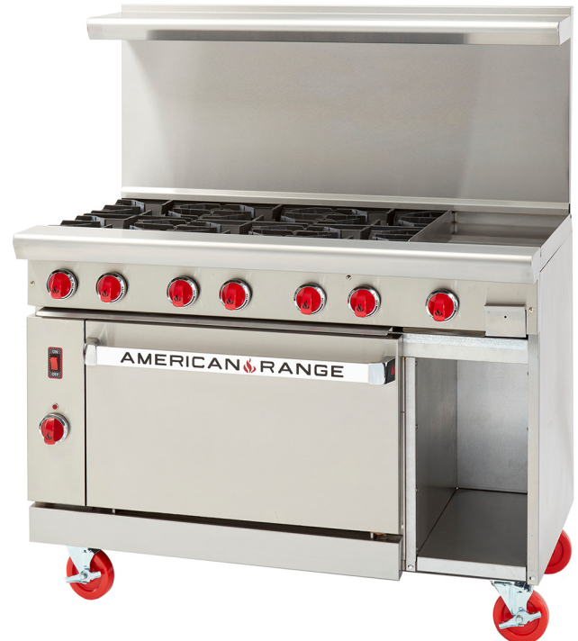
Model Shown ARGF-12G-6B-126L-SBR