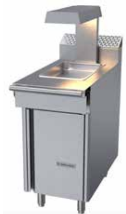
Model C18-FMD Shown as dump station with optional heat lamp