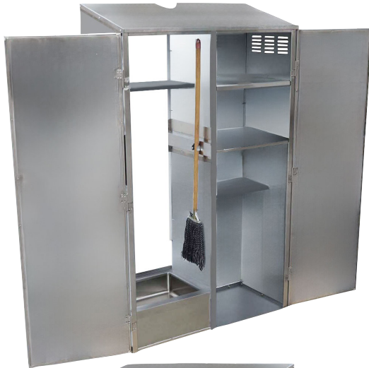
48231 Left Mop Sink