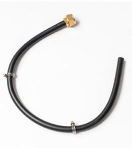
Service Faucet Hose