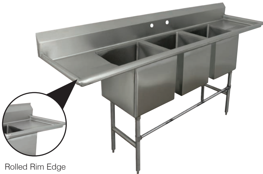
Rolled Rim Edge For Additional Strength

Item #: _____ Qty #: _____ Model #: _____ Project #: _____