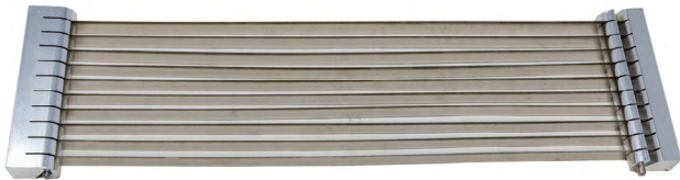
Straight Blade Set 10048