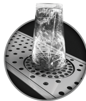
Integrated water glass rinser