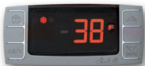
Adjustable Digital Thermostat! Easy to read exterior mounted