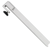
S-FENCE High food fence (12.125" x 1.125")