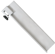
S-FENCEHI High food fence (12.125" x 3")