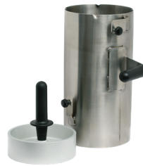
S-VEGHOP Vegetable Hopper