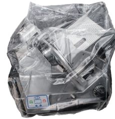
SC-LARGE Slicer Sanitation Cover