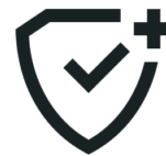
S-XDSL A Extended Warranty