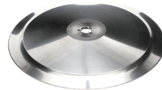
STAINLESS STEEL BLADE