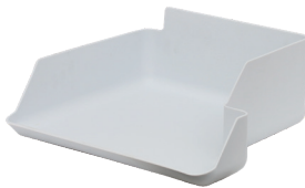
S-SLAWTRAY Slaw Tray