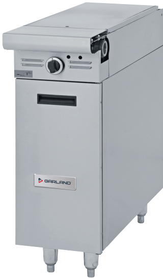
MST6S (valve control panel not as depicted) 17" Range Attachment With Even Heat Hot Top