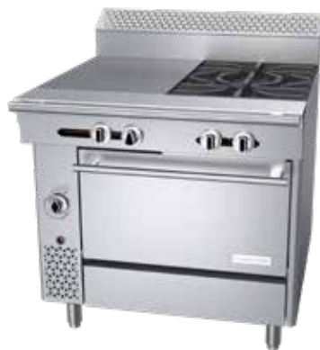
Model C36-14R Two 18" Open Burners with 18" Hot top