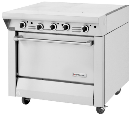
Model MST46R (valve control panel not as depicted) Two Section Even Heat Hot Top Range