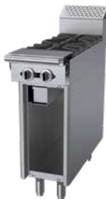
Model C12-6 12" Add-A-Unit Two Open Burners