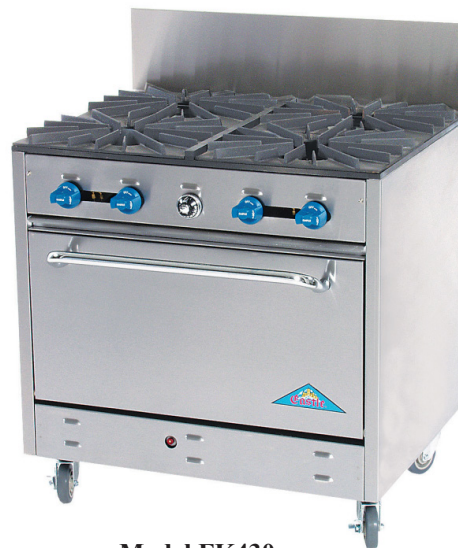
Model FK430 (shown with optional casters)