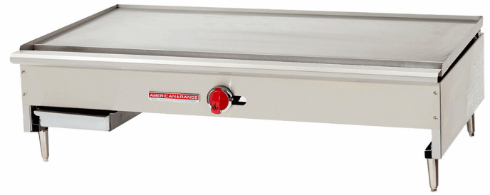
Model Shown ARTY-48