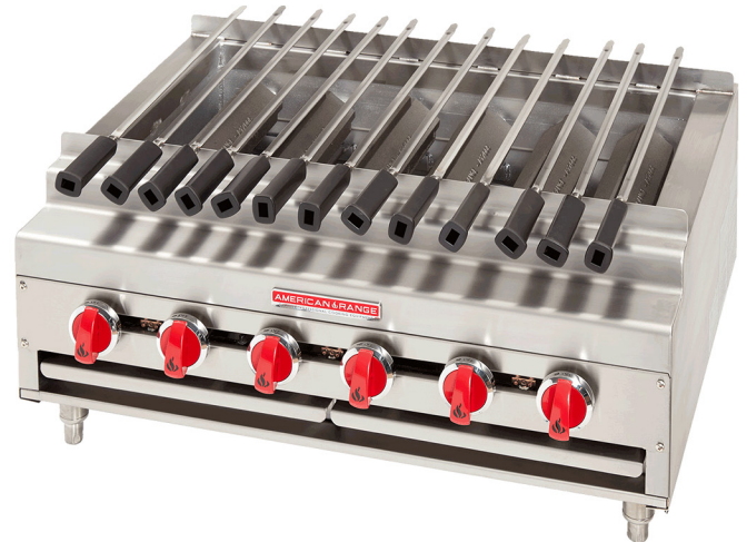
Model Shown ARKB-36