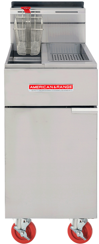
Model Shown AF25-DS Shown with optional casters