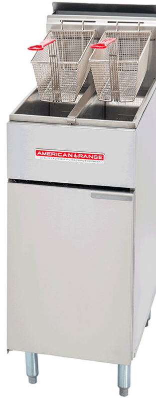
Model Shown AF25/25