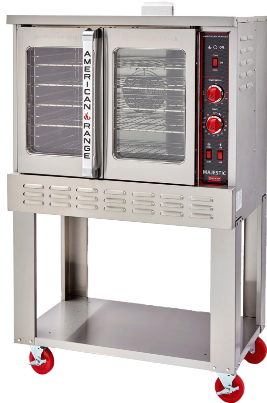
Model Shown ME-1GG

(Bakery Depth) Shown with optional casters