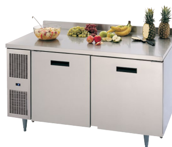
Model 9205F-290 shown