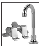
FOF-D Foot-operated faucet

Conforms to ANSI/NSF STD 2 Certified to CSA/CAN STD B45.4