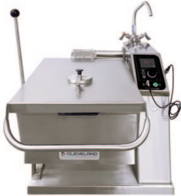
Shown with optional Double Pantry Faucet (DPK24)