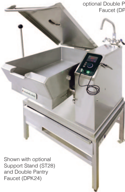
Shown with optional Support Stand (ST28) and Double Pantry Faucet (DPK24)