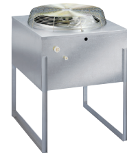
Standard Air-Cooled Remote JCT1200-261

Ice storage bin and JCT1200-261 remote condenser must be ordered separately. Consult remote condenser specification sheet for details. Tubing Kits come pre-charged with quick connects.