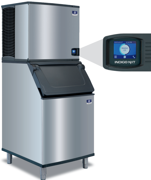
Indigo NXT Series IT0900N Ice Machine on a D570 Bin *Ice machine and bin sold separately

Designed for operators who know that ice is critical to their business, the Manitowoc Indigo NXT Series Ice Machine provides reliable and consistent performance. Built-in preventative diagnostics and programmable operation help minimize downtime and optimize total cost of ownership.