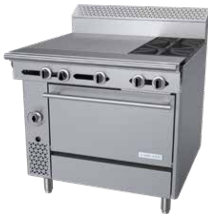
Model C36-12R Range with Two 12" Hot Tops and Two 12" Open Burners