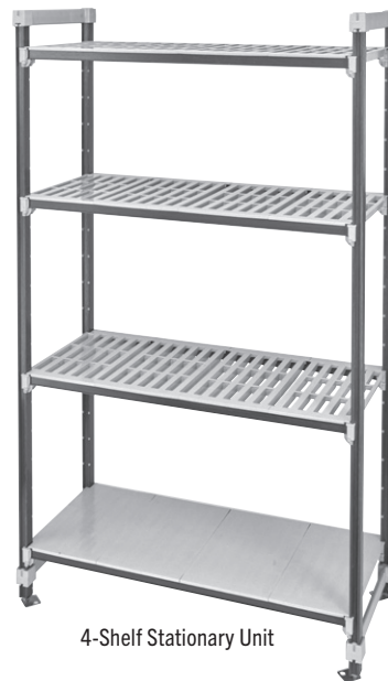
4-Shelf Stationary Unit